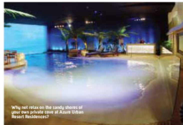
Why not relax on the sandy shores of your own private cove at Azure Urban Resort Residences?

So you don't have a billionaire's budget to splurge on a condo just yet. That doesn't mean you need to bid the luxe life goodbye. The secret is to shop around for developments that are pre-selling, which cost less than those that are already completed. Start a "High Life Fund" and set aside a portion of your income to go into this dream. Check out The Luxe List (below) for your options of pre-selling properties.