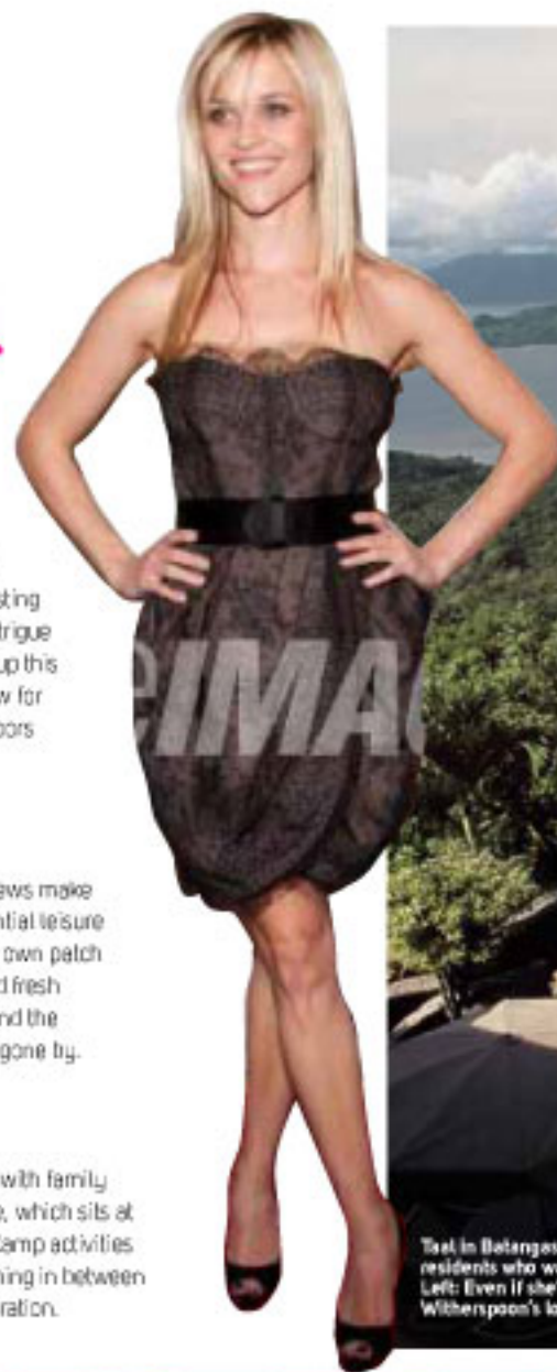
Teal in Batangas is a popular spot for residents who want to inhale fresh air. Left: Even if she's a Hollywood star, Reese Witherspoon's loves living in the countryside.

Get closer to Mother Nature as you bond with family and friends in the Mount Purro Nature Reserve, which sits at the foot of the Sierra Madre Mountain range. Camp activities range from rappelling to meditation and everything in between — leaving you with a rush, flushed with exhilaration. www.mycampexplore.com/home