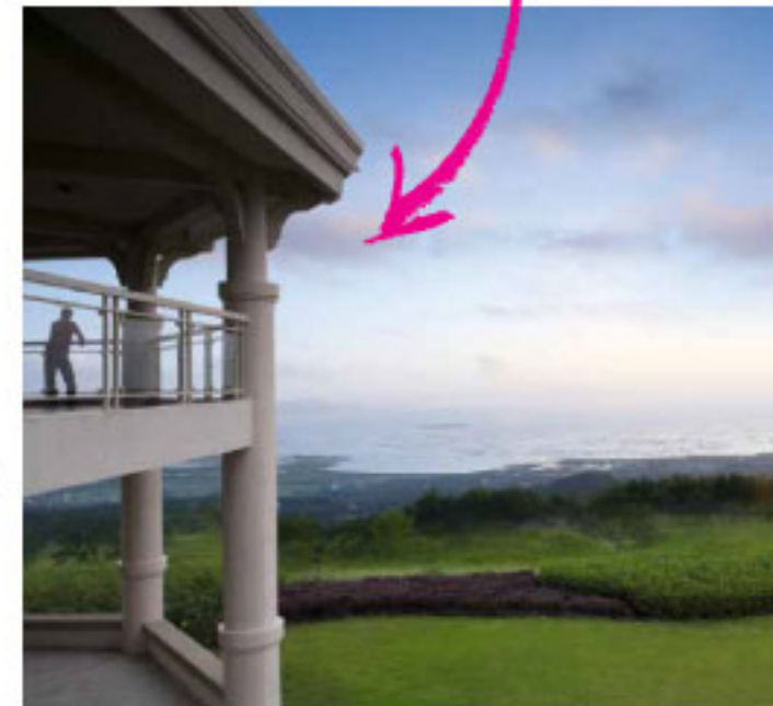
A cool climate and spectacular views are what make Ayala Greenfield Estates in Calamba, Laguna a golfer's dream

1 South Pacific Golf and Leisure Estates You'll hit two birdies with one stone when you invest in this exclusive leisure property in the town of Catalunan Pequeno in Davao City, as members immediately gain unlimited access to both the South Pacific Golf Club and the Bali Hai Beach Club in Talikud Island. Not that a life by the 18-hole course designed by Arnold Palmer isn't enough of a come-on. southpacific.opmc.ph/index.php