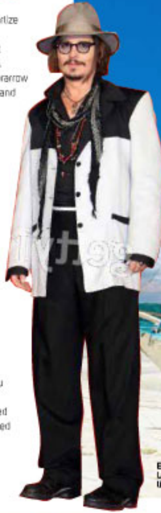
Escape to Boracay's white sandy beaches. Left: Johnny Depp is all for a sun-and-sea lifestyle — he owns his own island!

A term that means "family town" in Bahasa Indonesian, Kota Keluarga offers you the chance to turn your love for the beach into a permanent experience. A self-contained residential and commercial complex combined with a resort feel, this offers investors all the comforts of home along the relaxing shores of San Juan, Batangas. www.kotakeluarga.com