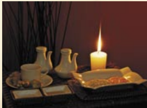
All natural and organic ingredients.

After a full day of fun and adventures on the beach, you deserve to pamper your feet with Siki-sikian (foot spa) and Hingut-an (head and shoulder massage) this cleaning and massage treatment will let you feel the soothing effect to your whole body and eases the aching muscle of your legs and calves. Gift yourself also with a Facial and indulge in the luxury and rich freshness of our very own unique signature facial treatment as it uses nature's gentle properties to work in the delicate area of our face, through gentle and careful stroke, it cleanses and nourishes your skin and helps rejuvenate your face and regain its radiant and youthful glow.