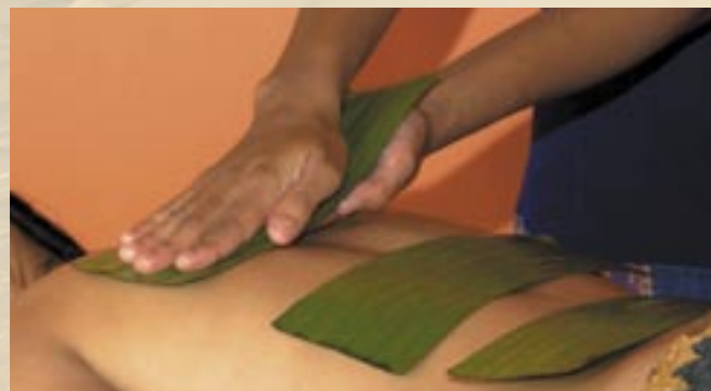
Traditional Filipino Massage "Hilot"

All prices are subject to 10% Service Charge and 12% VAT